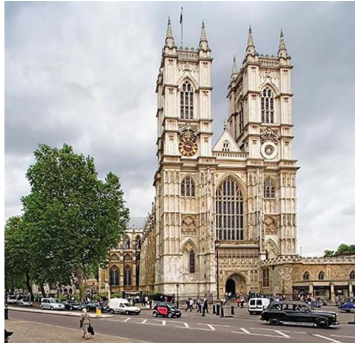
Westminster Abbey will be among the sites the J2A pilgrims visit while in London.

Adventures, small and great, are undertaken. Creativity soars. Wonderful worlds open up and are explored by the minds of children as they reach out to take what is theirs – the future.