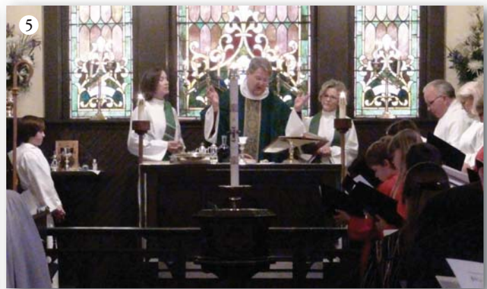
Many parishioners from St. Martin's were present at the installation.