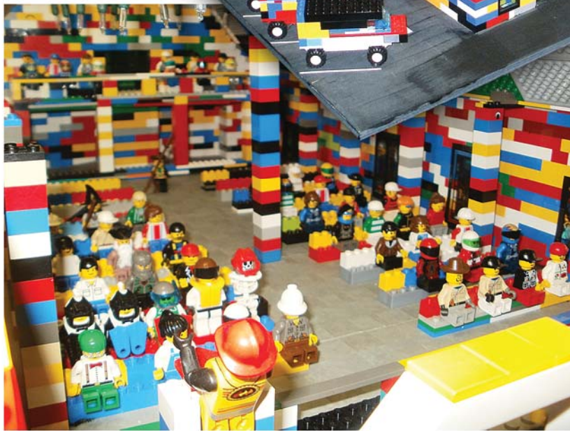
The congregation as seen from the pulpit.