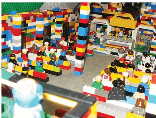
The congregation and altar as seen from the balcony.