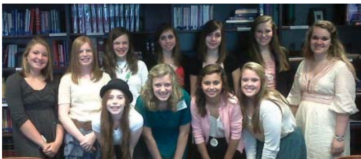
The Junior Daughters of the King

In case you are unaware of this order, The Order of the Daughters of the King® (DOK) is a spiritual sisterhood of women dedicated to a life of Prayer, Service and Evangelism. Their membership includes women in the Anglican, Episcopal, Lutheran and Roman Catholic churches. So naturally, the Jr. DOK are young girls who also take a vow of daily prayer and service.