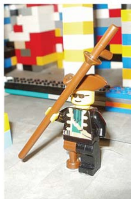
The pirate Verger (Verg-AR!)