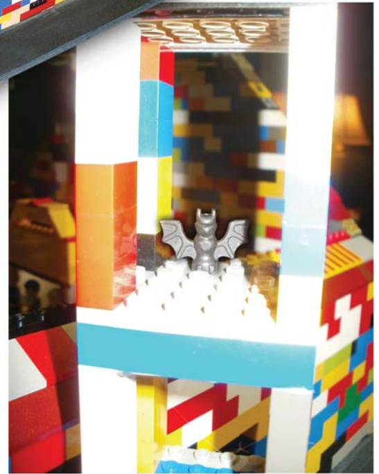
Bats in the belfry.